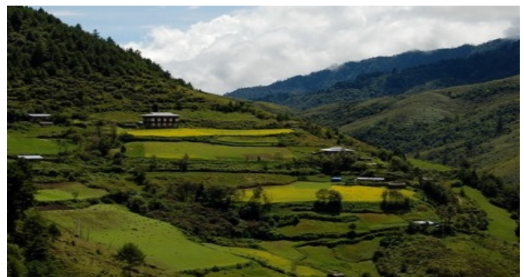
Fig.1. Mustard sown on dryland after potato harvest