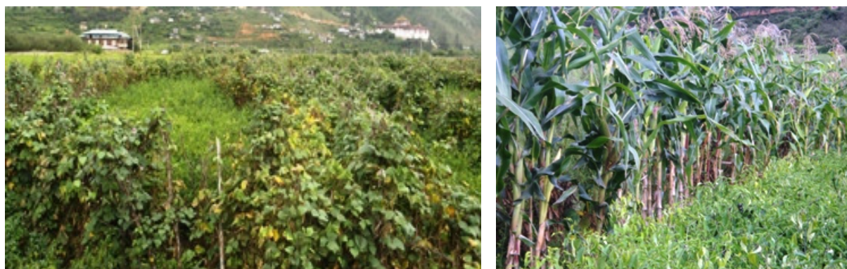
Fig.3. Modified strip cropping of beans (left) and maize with chilly (right) in Paro Dzongkhag

Chilly- Beans/maize - A modified form of strip cropping innovated by the farmers is practiced in the peri-urban area of Paro and Thimphu Dzongkhags mainly in vegetables. This form of cropping follows the principle of strip cropping but the strip of the companion crop which is maize and climbing beans are not in straight row (Fig. 3). This system makes a very efficient use of the land and also maximizes the income of the farmers from the sale of chilly, maize and beans.